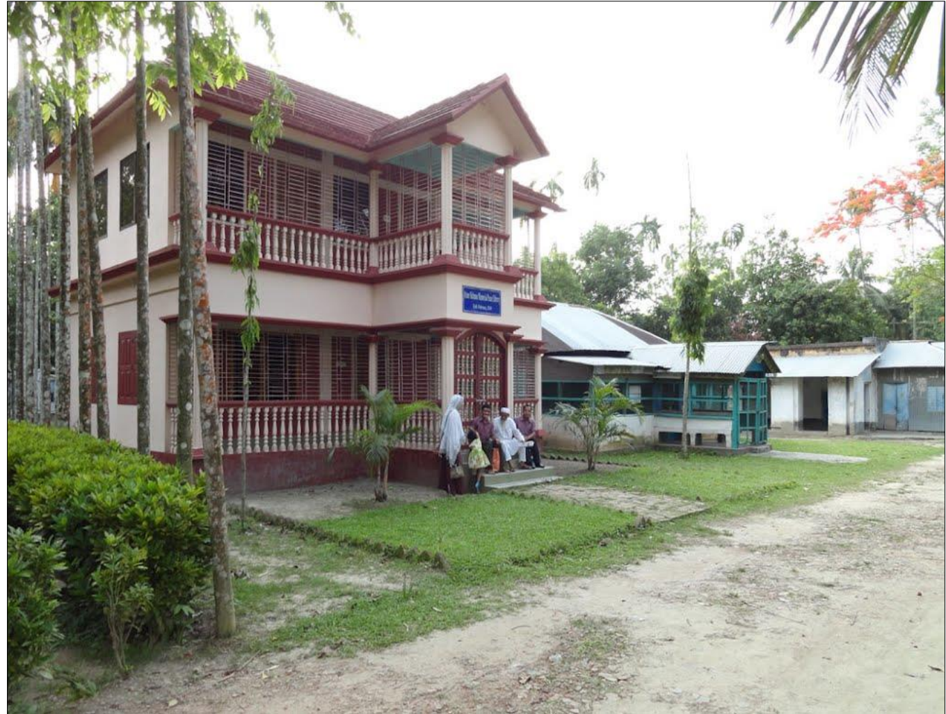
GUP Peace Centre, Rajoir, Bangladesh